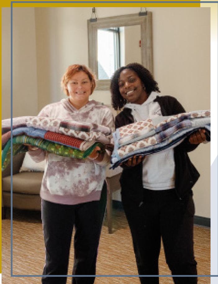
Toby's Place residents with the quilts

When I heard that we had donors dropping off handmade quilts, I thought, "Wow, we have so many creative and unique people in the Oliver Gospel community." And it's true! One of our very own baristas has a background in art and design, bringing creativity to The Roastery. A local middle schooler organized a "fun run" this past fall to raise money for Toby's Place. These are just a few examples of the exceptional gifts that Oliver Gospel receives from our community. Every donor, volunteer, staff member, and guest contributes unique talents to Oliver Gospel, and TOGETHER we create a beautiful community, woven together, much like those handmade quilts. And, TOGETHER we, as the Oliver Gospel family, bring beauty to the city of Columbia. Thank you for giving your talents, your time, and your treasures to the Oliver Gospel "quilt". You make our community stronger and more beautiful.